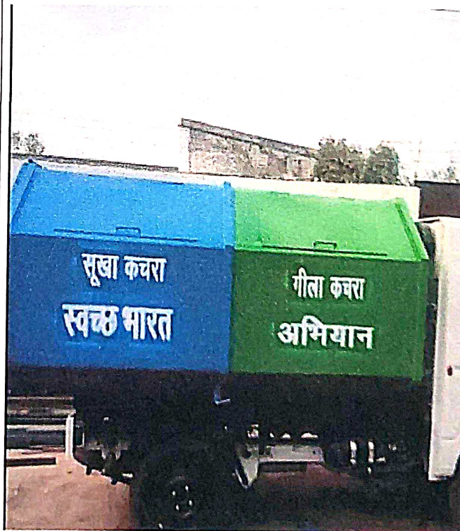
Tata Tripper Garbage Van